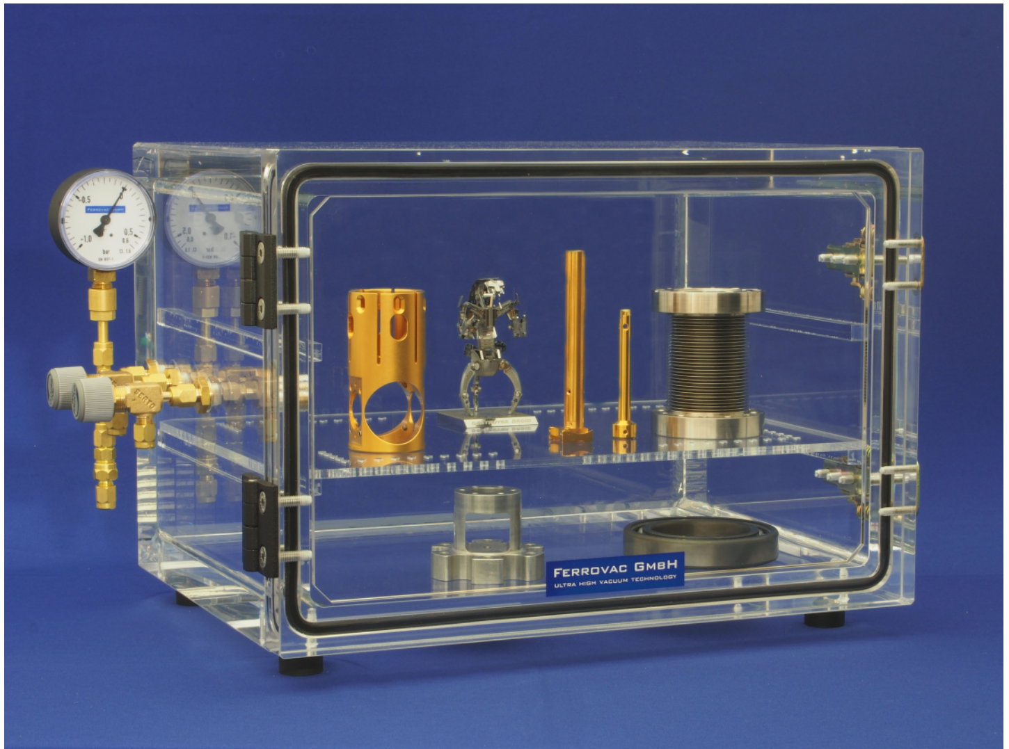
EXICA3S Vacuum Dessiccator